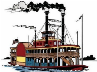
Village of Valmeyer Established 1909

Village of Valmeyer 260 Knobloch Blvd. Valmeyer, IL 62295